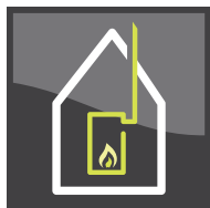
Solid fuel and bio-fuel boilers (pellets etc.)