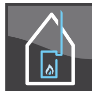
Oil and gas boilers