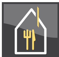
Restaurants and pubs