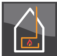
Solid fuel and wood-burning stoves and fireplaces

exodraft – formerly known as EXHAUSTO Ltd.