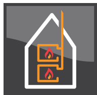
Decentralized multiple fireplaces connected to same chimney