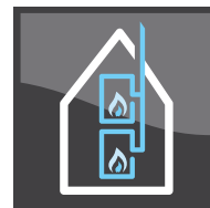
Decentralized multiple heating appliances connected to same chimney